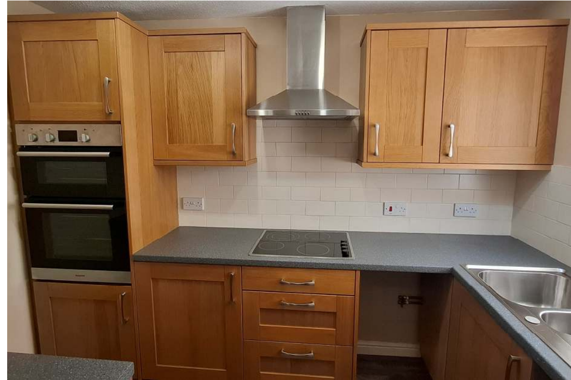
Living room / kitchen / one of two bedrooms and supporting bathroom